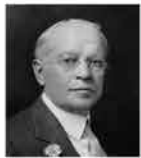
Charles H. Hood

A New England dairy industry pioneer in the 1800s, his drive to improve sanitary production and distribution of the milk he sold revolutionized the industry – and dramatically increased the survival rate for infants in the region.