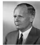
Harvey P. Hood II

A New England dairy industry pioneer in the 1800s, his drive to improve sanitary production and distribution of the milk he sold revolutionized the industry – and dramatically increased the survival rate for infants in the region.